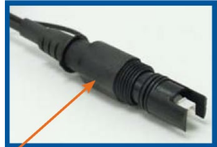
Ruggedized Connector (OSP hardened SC/APC)